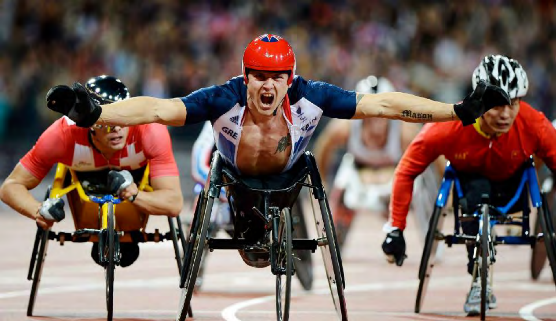
David Weir from Wallington currently holds six Paralympic gold medals