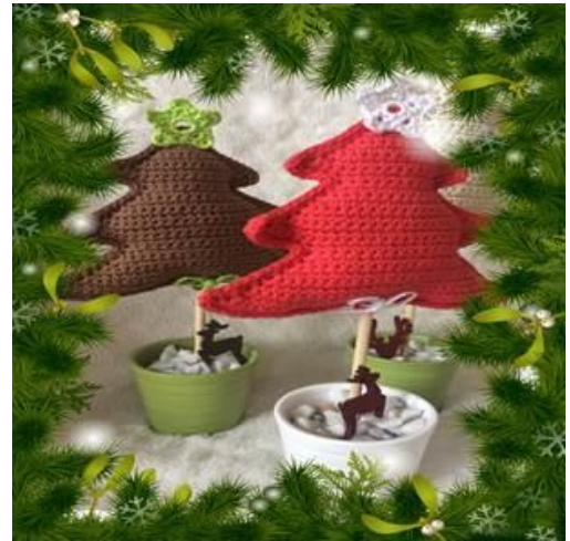
The Secret Garden