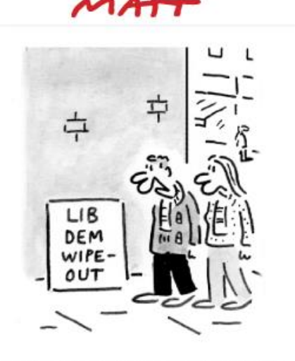
'We'll always have our student loans to remember them by'